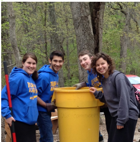
Spreading mulch at the World Bird Sanctuary