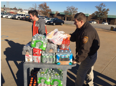
Delivering supplies to County Police