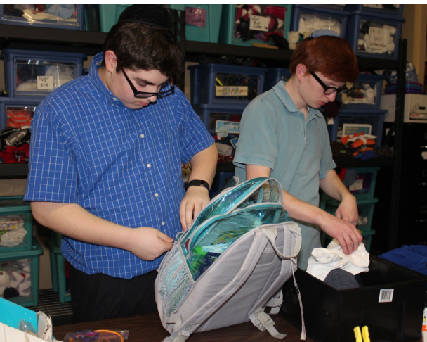
Packing backpacks for at-risk children at Project Backpack